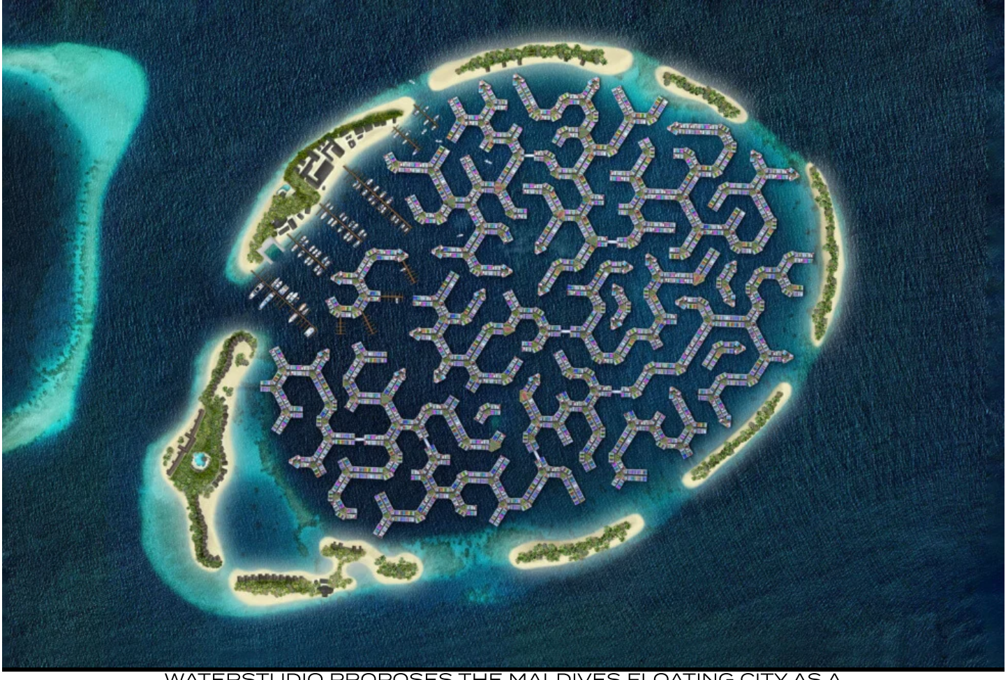
WATERSTUDIO PROPOSES THE MALDIVES FLOATING CITY AS A SOLUTION TO RISING SEA LEVELS