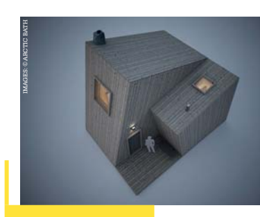
Above and below: Designs for the Arctic Bath, due to open in Sweden in 2018. Inset: Bertil Harström

Floating structures have been around for a long time. People have been living on houseboats for centuries in cities like Amsterdam, while in Hong Kong, thousands of people lived in massive floating villages as recently as the 1970s. Even today, the flying eaves and sultry neon of that city's Jumbo Floating Restaurant evoke a particular kind of romance. Water has always promised a sort of