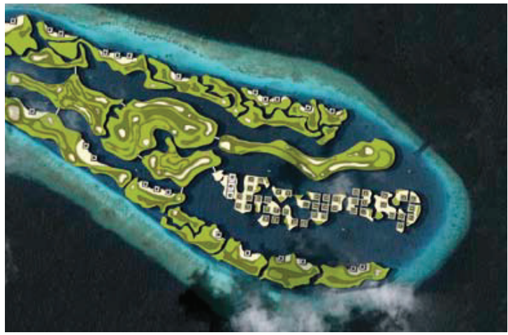
Left: Golfers make their way through a glass tunnel to reach the course. Right: the 18-hole golf course has 360° ocean views and plenty of challenges for even the most experienced golfer.

developments are luxury resorts, catering for the more elite visitor. But van de Camp explains that the 5 Lagoons Project aims to provide a whole range of resort and business activities from reasonably-priced to ultra-luxurious. The Green Star hotel will provide the best-priced rooms, with the floating palaces in the golf course at the top end of the market.