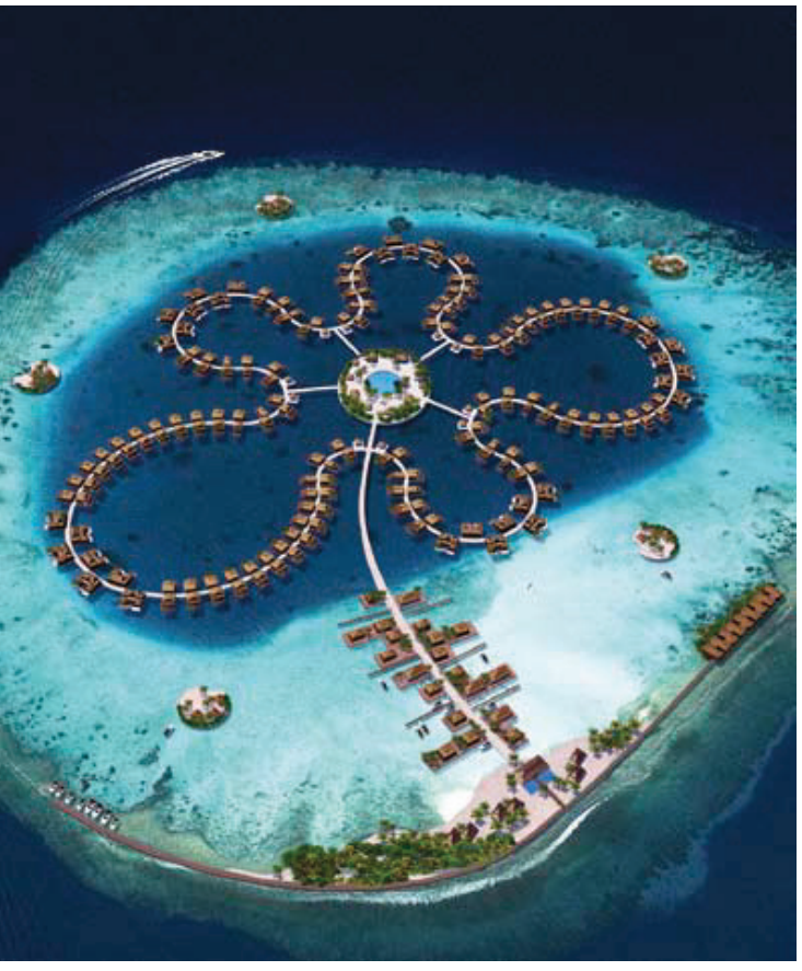
Construction of the Ocean Flower, located in the North Male atoll, is scheduled to start soon and will include villas in three different price ranges.

greens and a 9 hole par 3 Academy course. A separate area on the island provides romantic homes and