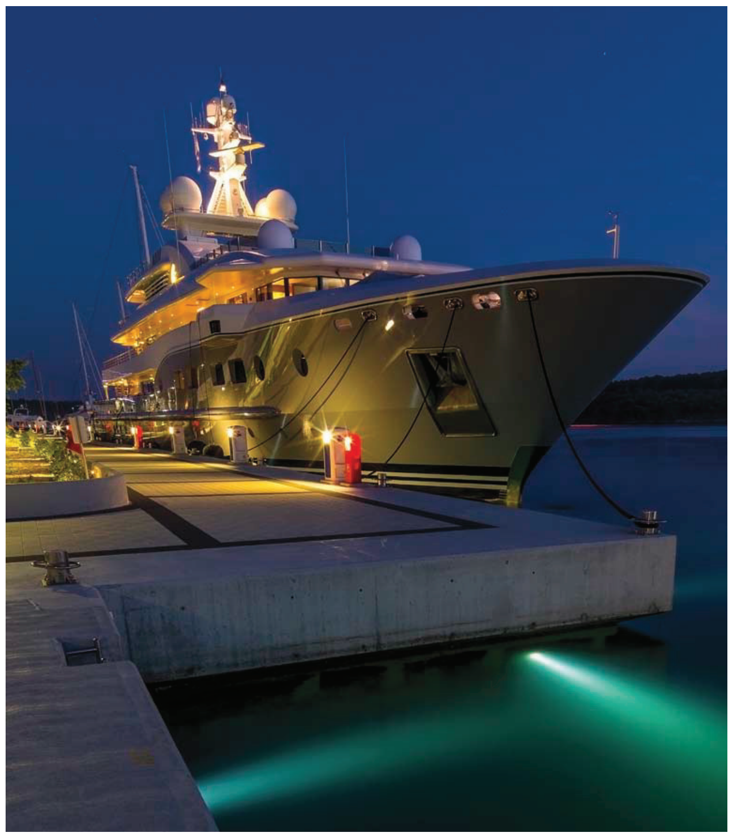
Essential reading for marina and waterfront developers, planners and operators