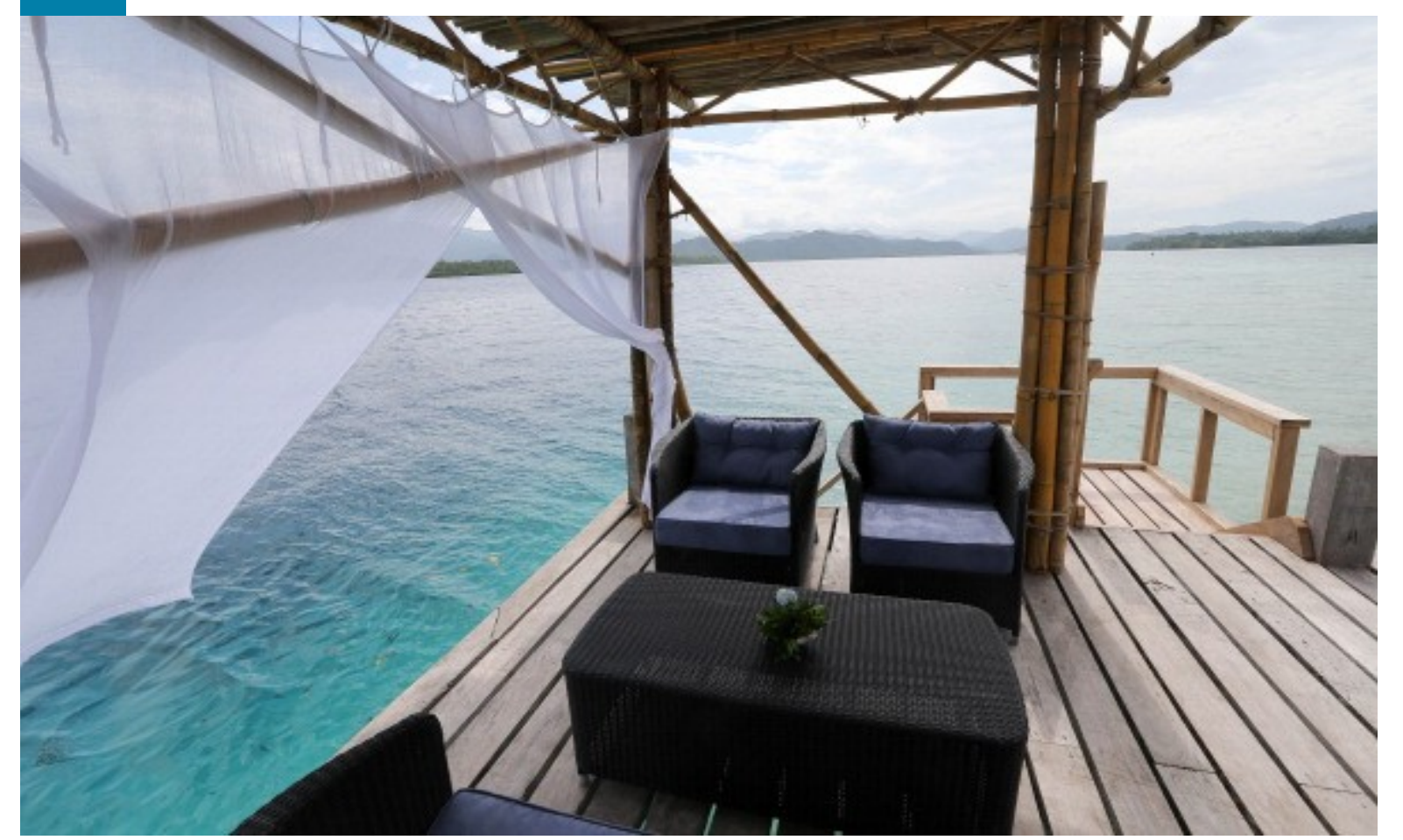
HONIARA, GUADALCANAL ISLAND, SOLOMON ISLANDS - SEPTEMBER 17: The lodge and private beach where Catherine, Duchess of Cambridge and Prince William, Duke of Cambridge are to spend the night on the island of Tuvanipupu on their Diamond Jubilee tour of the Far East on September 17, 2012 in Honiara, Guadalcanal Island. Prince William, Duke of Cambridge and Catherine, Duchess of Cambridge are on a Diamond Jubilee tour representing the Queen taking in Singapore, Malaysia, the Solomon Islands and Tuvalu.

Christie's International Real Estate has taken luxury properties into a whole different level. The company is set to start Amillarah Private Islands, a floating island empire to be first established in the tiny islands of Maldives, which will possibly expand to Dubai and Miami in the years to come.