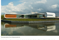
The description from Waterstudio NL .