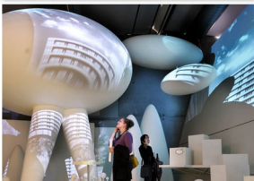
Inside Dutchville.

Exhibition | NAI Rotterdam - | 01/07/11-01/07/16